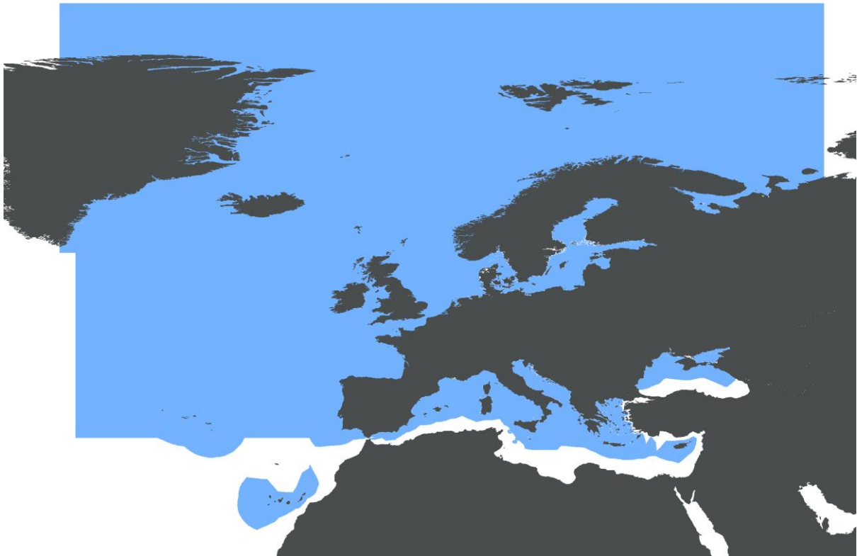
Figure 1 ESCA KIS-ORCA boundary

The expanded KIS-ORCA project area for 2018 has been defined by the OSPAR area plus the EEZ waters of geographic Europe. Figure 1 depicts this area in blue. Figure 2 and Table 1 illustrate the OSPAR area and provide coordinates for this area. The EEZ boundaries have been derived from the MarineRegions dataset which is publically available for download here: http://www.marineregions.org/